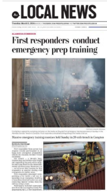
Press-Telegram / Daily Breeze