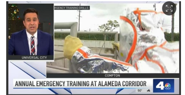
KNBC-TV Channel 4